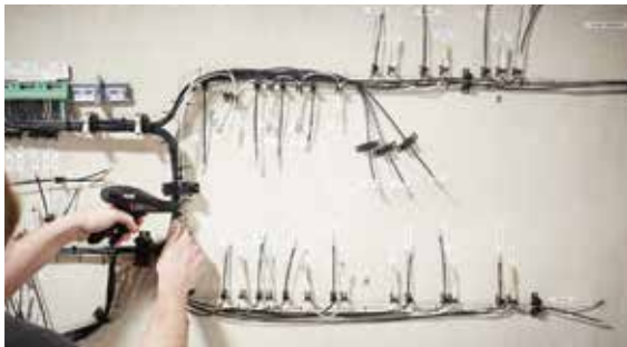
Wire Harness Assembly