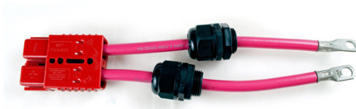
Battery Charger Connectors and Cables