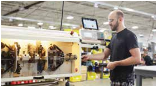
Cut and Strip 252 mcm to 30 ga Wire