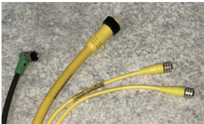
Robotic Control Cordsets