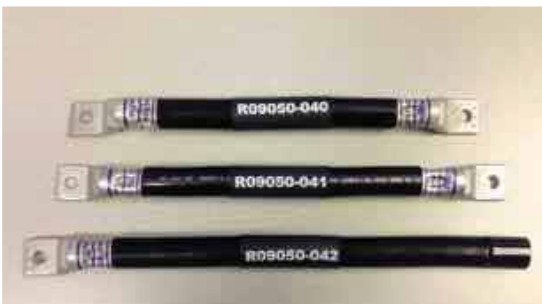
Custom Labeling and Kitting