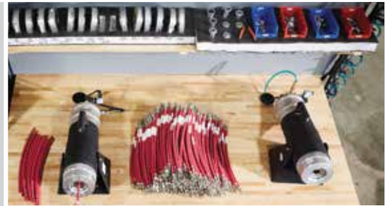
Large Lug Crimping 250 mcm to 8 ga Wire