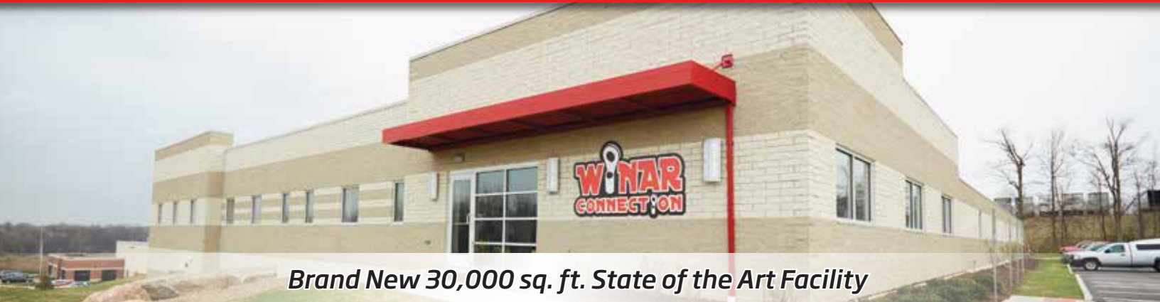
Brand New 30,000 sq. ft. State of the Art Facility

34 YEARS EXPERIENCE IN WIRE HARNESSES AND CABLE ASSEMBLIES